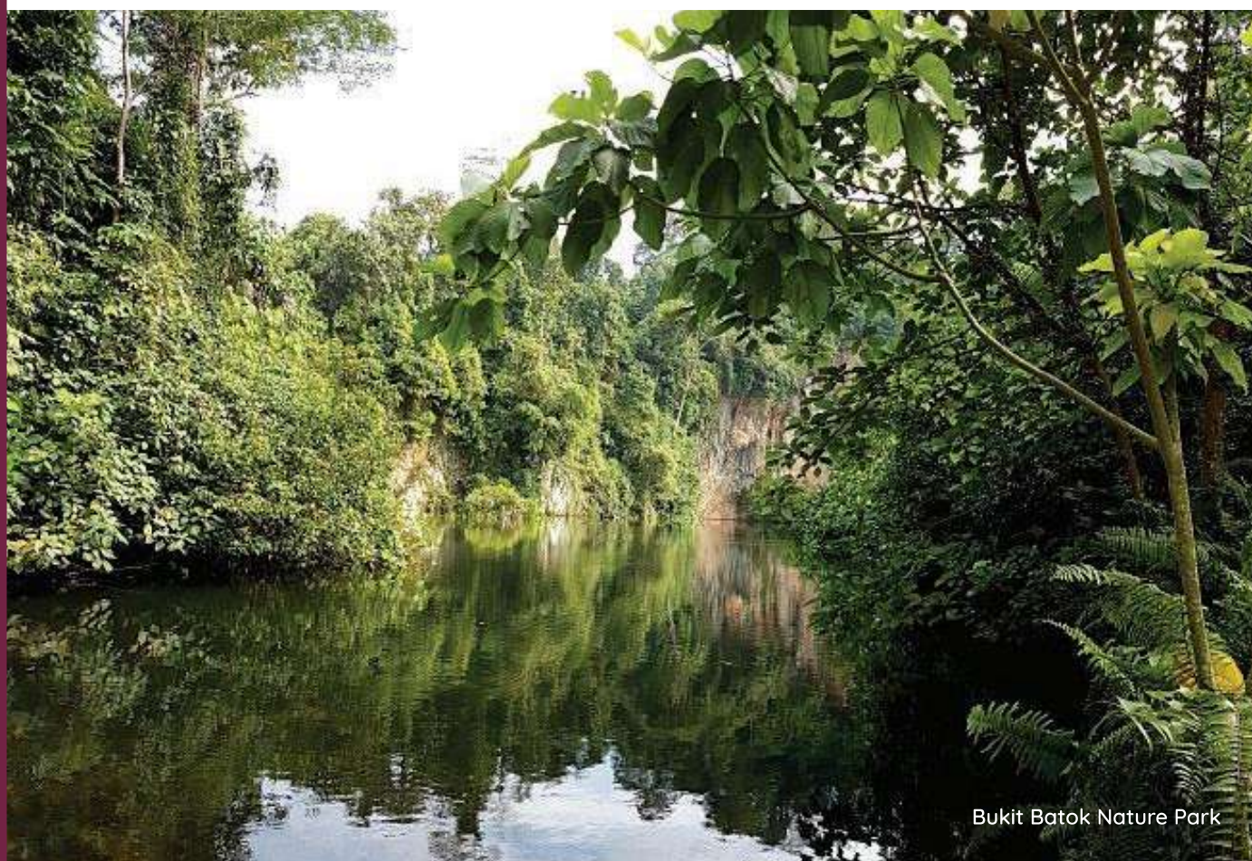
Bukit Batok Nature Park

Our towns are planned to be liveable and self-sufficient, with easily accessible shops, health care, schools, community facilities and parks. Commercial nodes, industrial estates and business parks within or nearby the town, also help to provide nearer job opportunities for residents. The detailed planning and implementation of plans for each town is a joint effort of many government agencies.